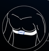
Heart Rate Strap